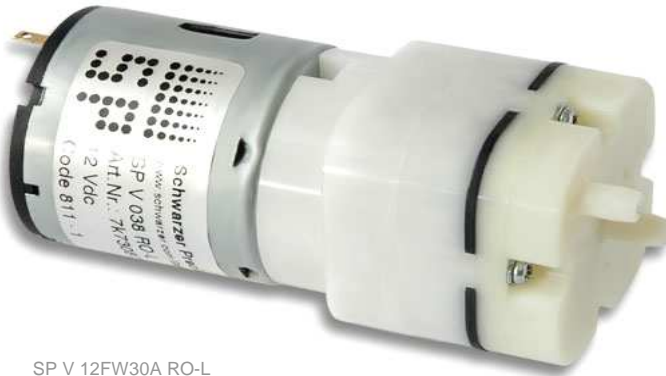
SP V 12FW30A RO-L