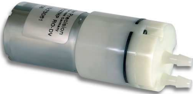
SP V 12TW27 RO-L