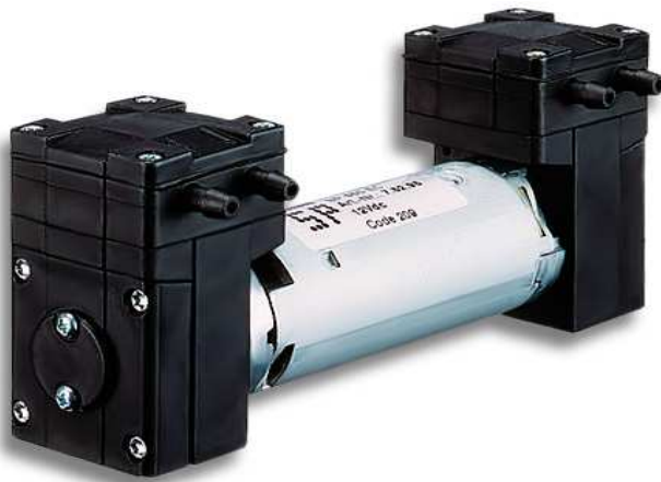
SP 620 EC-TH-L