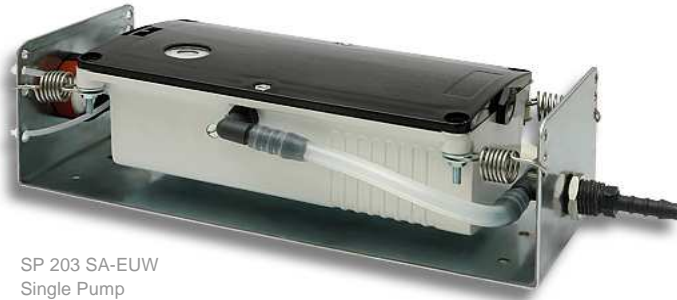
SP 203 SA-EUW Single Pump