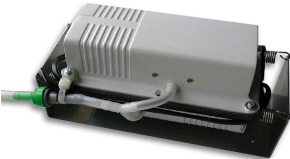
7s03020 - Twin Pump fitted with Pressure Switch