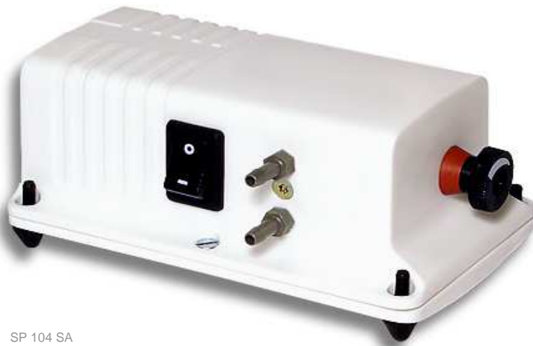
SP 104 SA