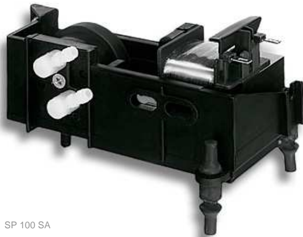
SP 100 SA