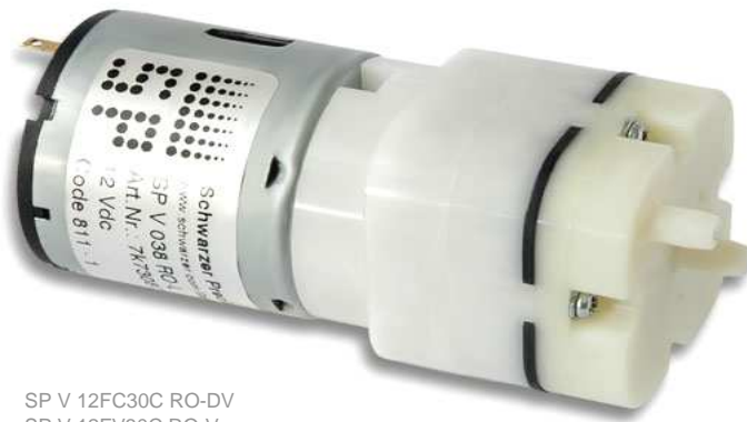
SP V 12FC30C RO-DV SP V 12FV30C RO-V