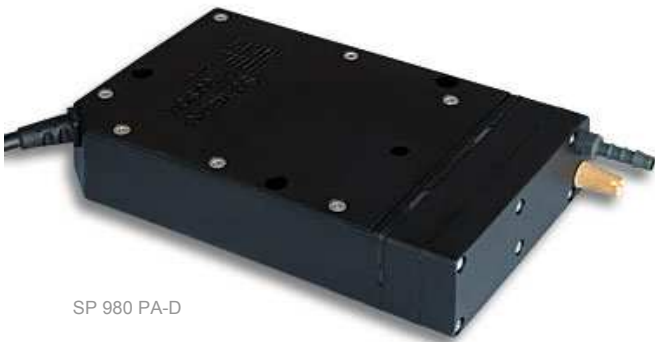
SP 980 PA-D