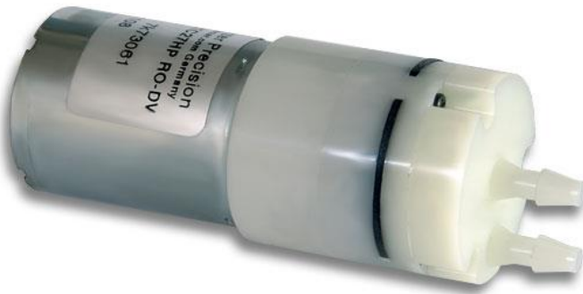
SP V 12TW27D RO-L